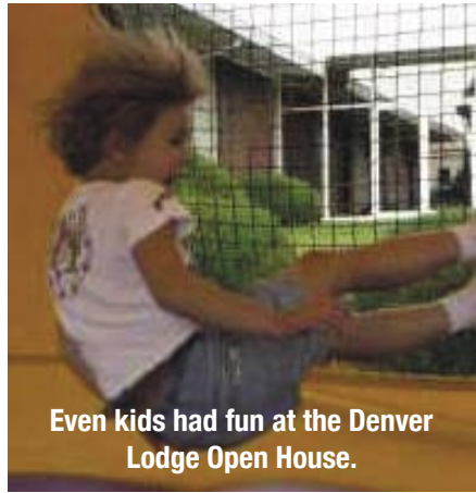
Even kids had fun at the Denver Lodge Open House.

Congratulations to the Denver Lodge #2075 on a successful open house that was launched by a dynamic marketing campaign (see Italian America, fall 2006). Seventy-five prospective members attended the event that featured a bocce tournament and a moon bounce for the kids. By the end of the day 15 new members, most with young families, signed up and many more took applications home.