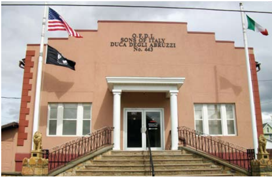
The Duca Degli Abruzzi Lodge #443 in Endicott, NY