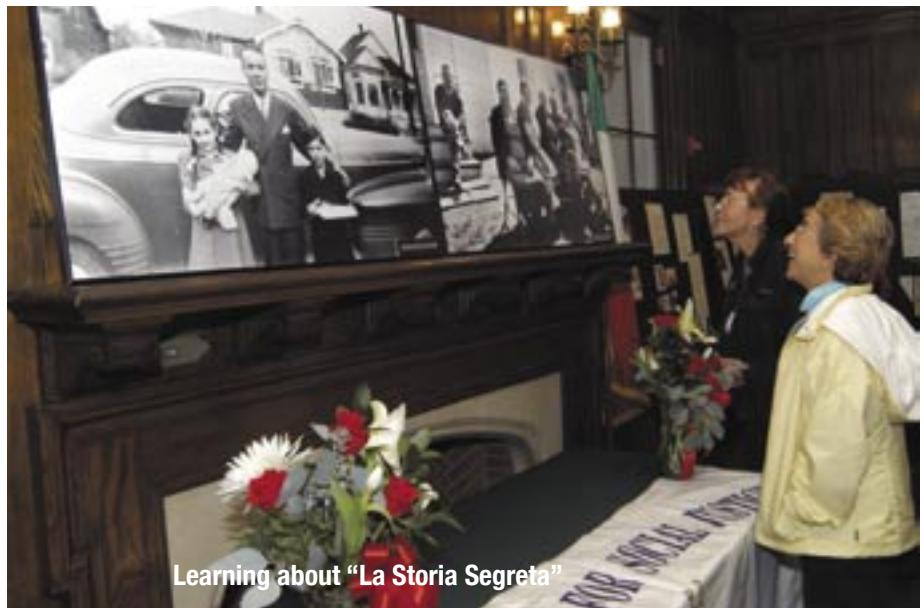
Learning about "La Storia Segreta"