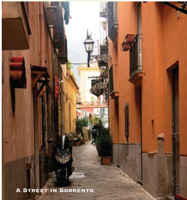
A STREET IN SORRENTO