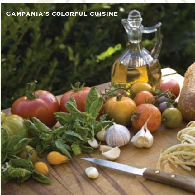
CAMPANIA'S COLORFUL CUISINE