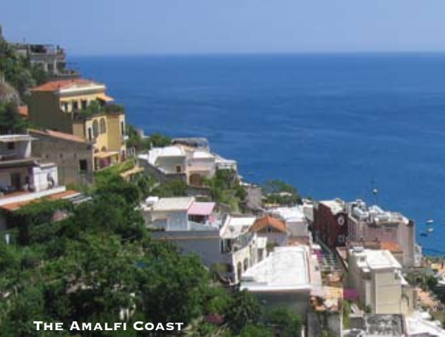
THE AMALFI COAST